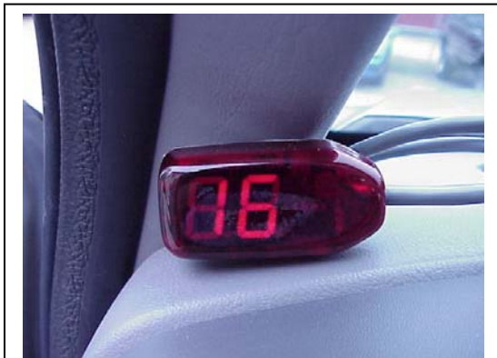
PARKAID-16C Remote Display